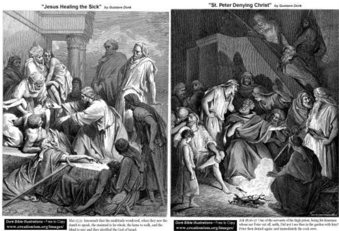
Figure 2 – Healing the Sick - Peter Denies Christ (Gustave Doré)